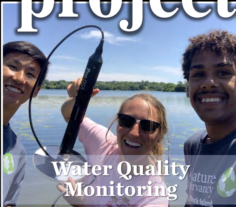
Water Quality Monitoring