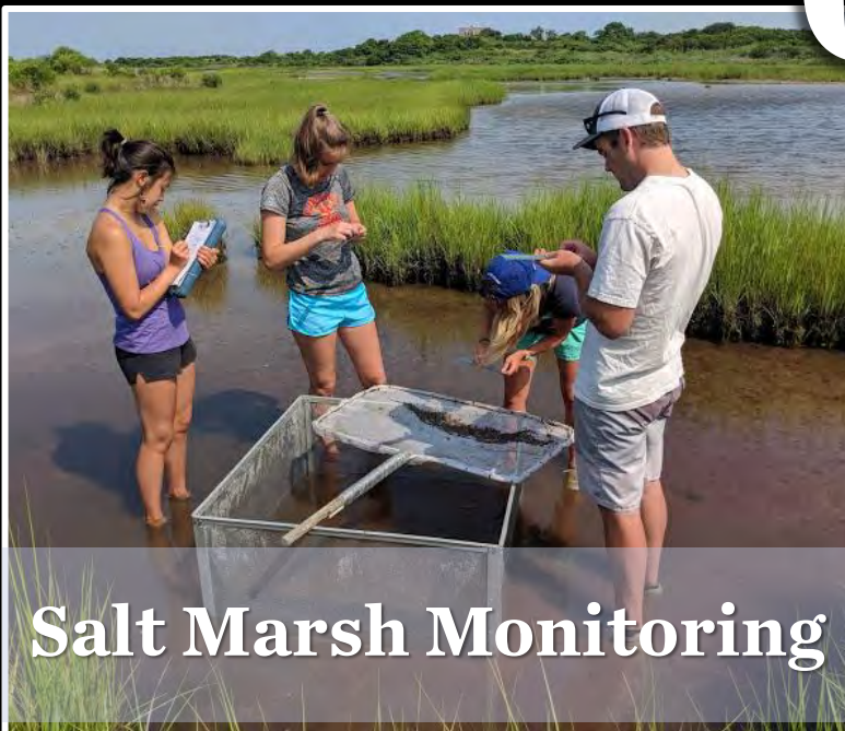
Salt Marsh Monitoring